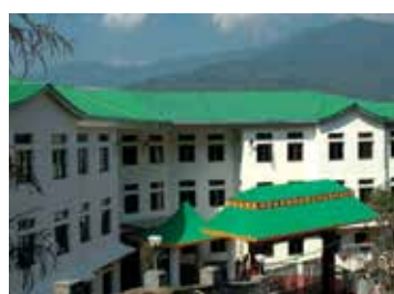
The ICFAI University, Sikkim