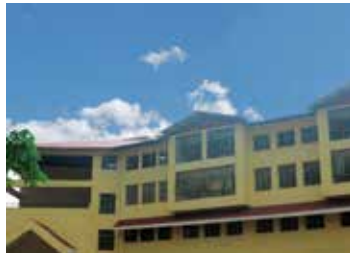
The ICFAI University, Meghalaya