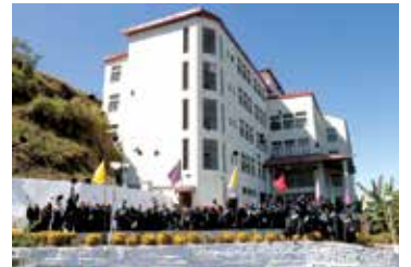
The ICFAI University, Mizoram