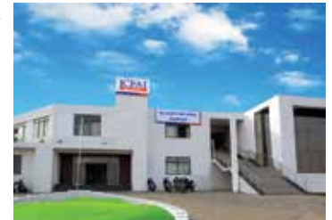
The ICFAI University, Jharkhand