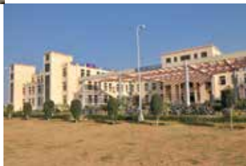
The ICFAI University, Jaipur