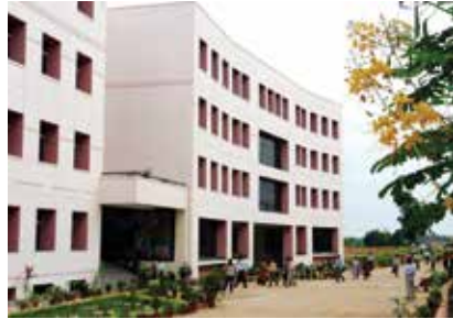
The ICFAI University, Tripura

ICFAI has established 11 Universities across India. The ICFAI Universities are located at Hyderabad [The ICFAI Foundation for Higher Education (IFHE), which is a Deemed University], Dehradun, Himachal Pradesh (Baddi), Jaipur, Jharkhand, Meghalaya, Mizoram, Nagaland, Raipur, Sikkim and Tripura.