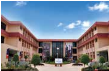
The ICFAI University, Dehradun