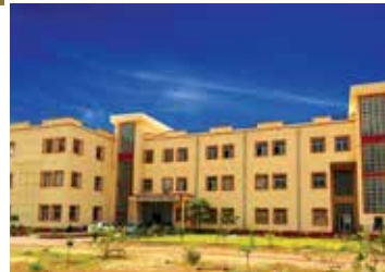
The ICFAI University, Raipur