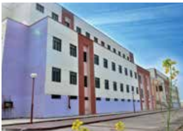
The ICFAI University, Himachal Pradesh (Baddi)