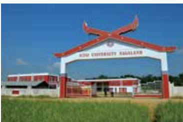
The ICFAI University, Nagaland